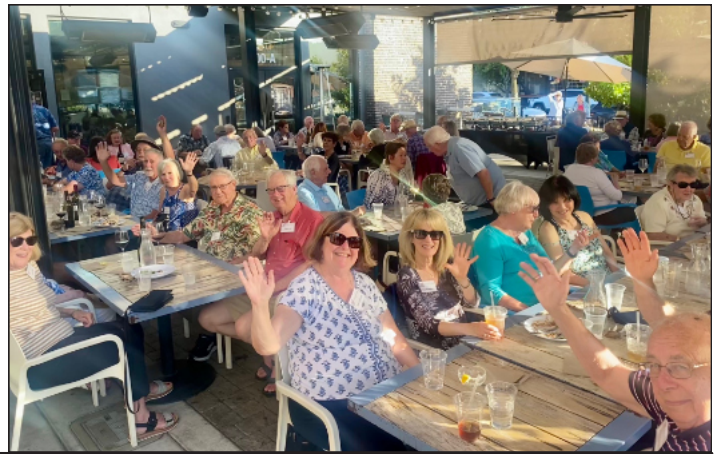
Dine-O-SIR at Hazy BBQ on June 25