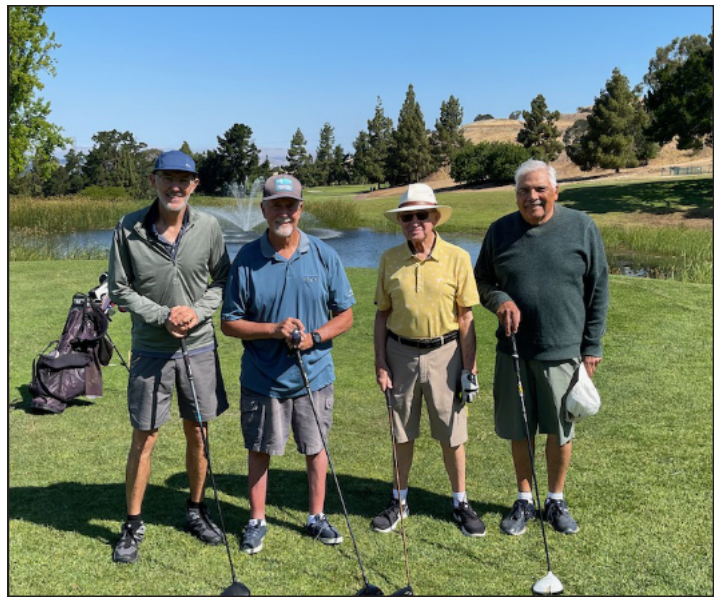
Some 18 hole group foursomes at Boundary Oak on June 16 th