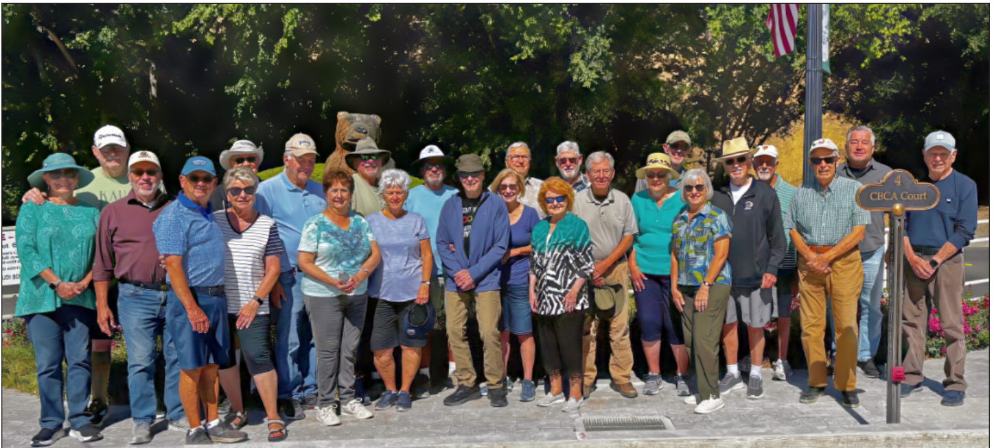
The SIR Branch 116 Bocce group enjoys a mild summer day at the Bocce courts in Clayton.