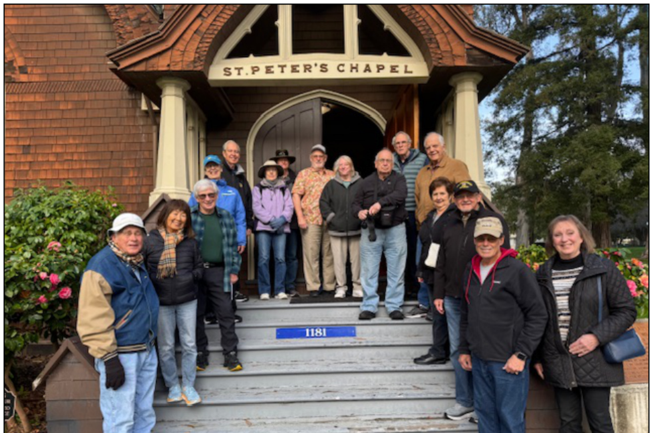
Walking Tour at St. Peter's Chapel, Mare Island on March 15th

The event fostered a sense of community and shared appreciation for Mare Island's unique legacy. Participants enjoyed each other's company and the shared meals, making the day both educational and enjoyable.