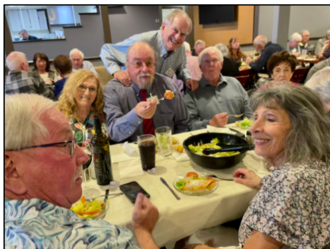
Large turnout for Dine-O-SIR at DeVino's on March 26