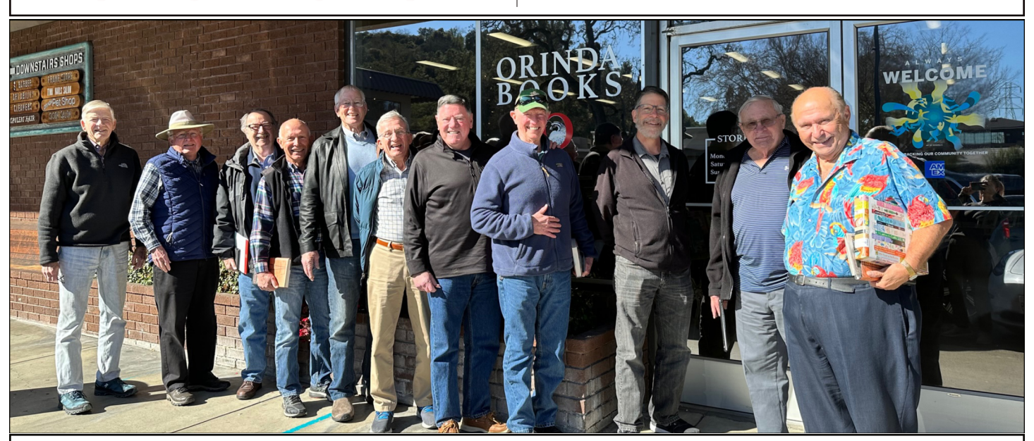
Book Group 1 gathering in front of Orinda Books on January 27th

New members are always welcome. It's a discussion, not a class. If possible, contact Rich Black at Blackrw41@comcast net ahead of time.