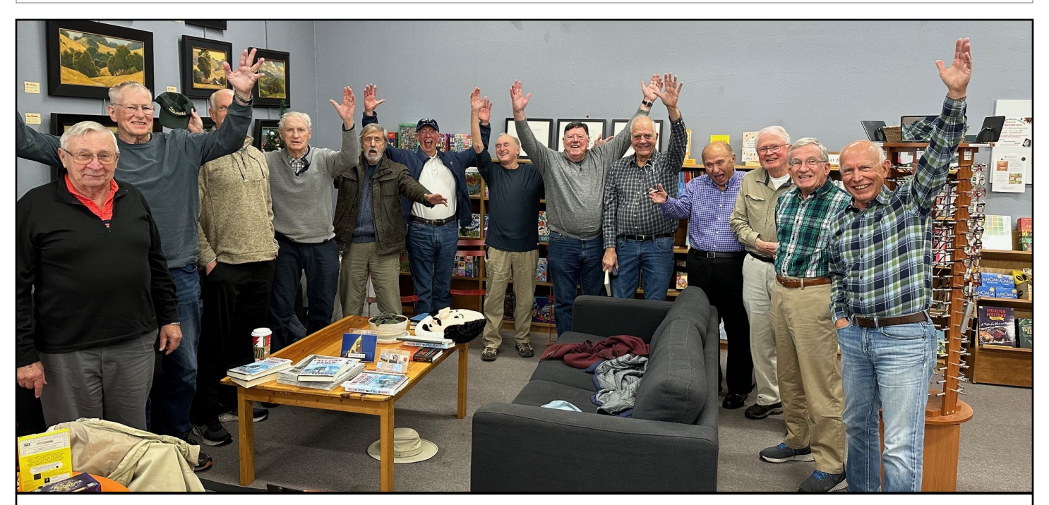
Book Group 1 Waving Year 2022 Goodbye

Hope to see a newbe or two at Orinda Books in 2023.