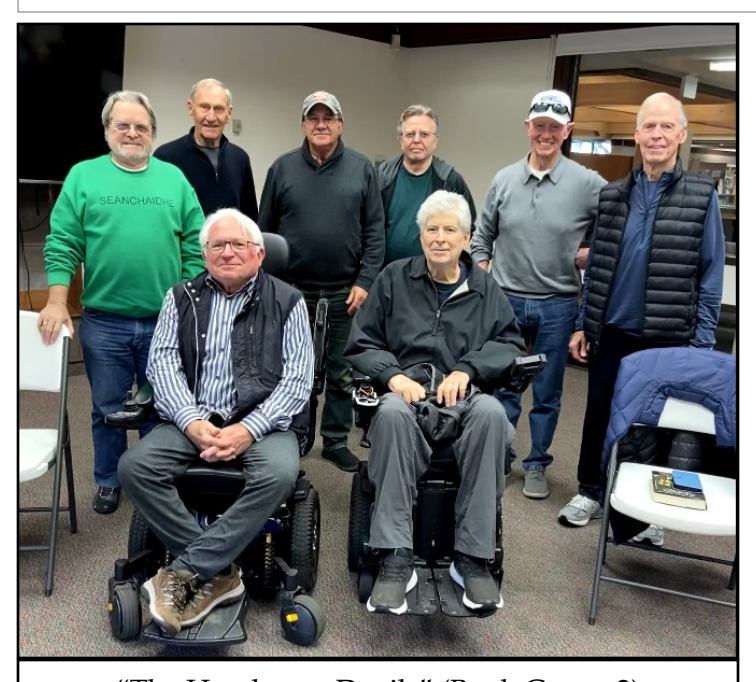
"The Handsome Devils" (Book Group 2)

On a 5 point scale, members voted "The Escape Artist" a 3.85 score.