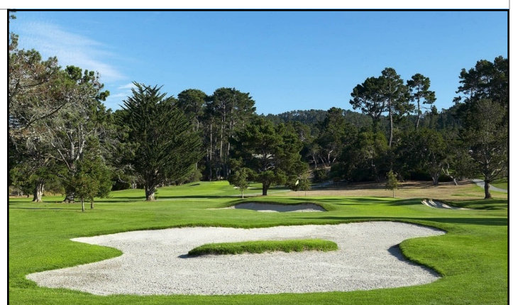
Pacific Grove Golf Course