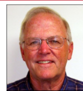
Member. Sec. Phil Goff