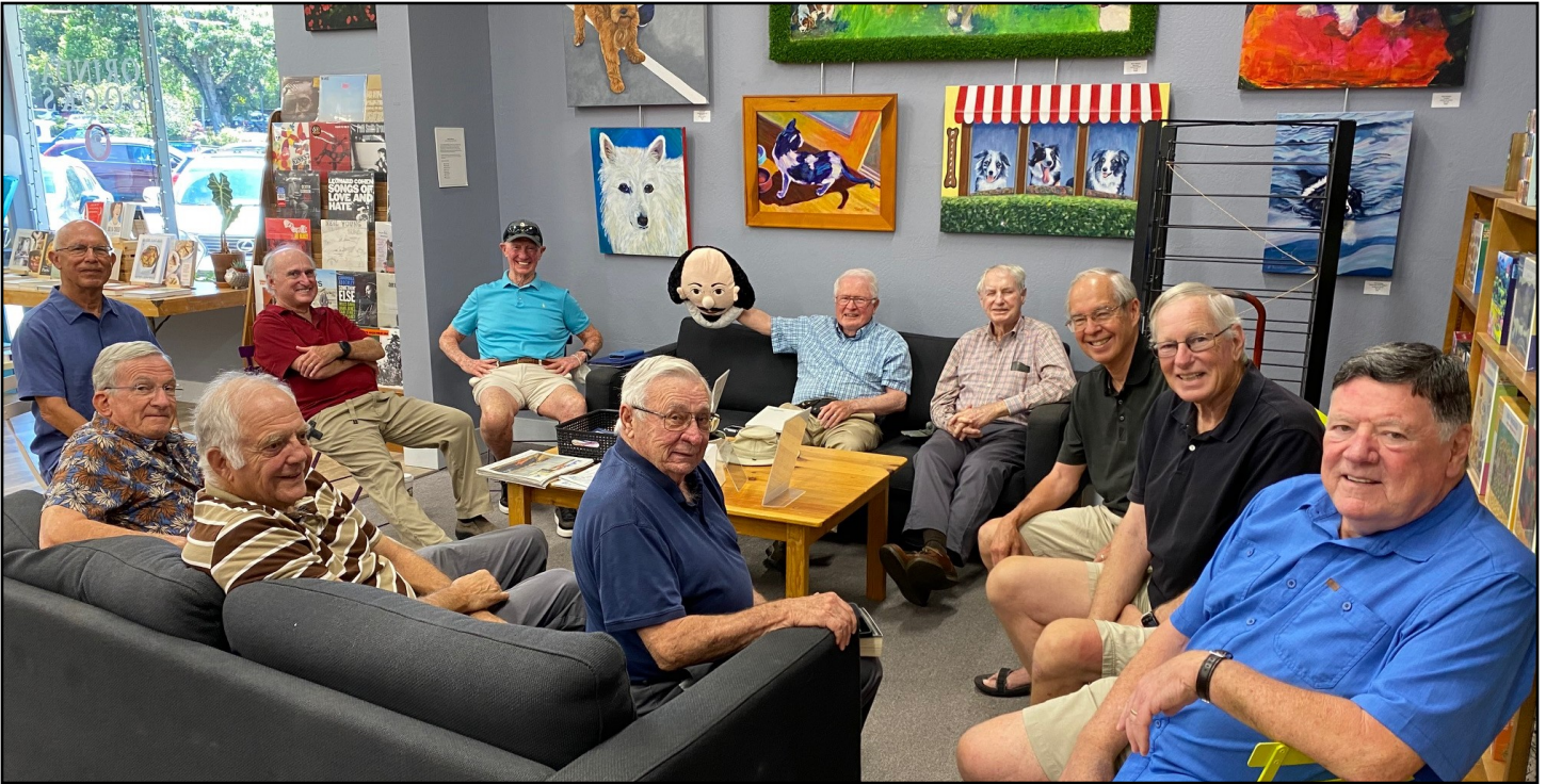
Book Group 1 at June 27th Meeting (Picture, including guest William Shakespeare,)