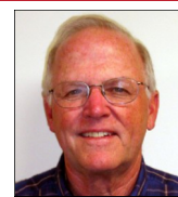
Member. Sec. Phil Goff