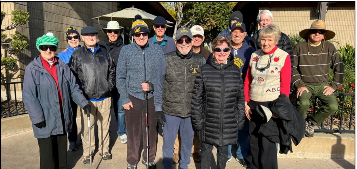
Amiable Amblers on November 11

These walks are for individuals or couples, as spouses and significant others are encouraged to participate. The significant other/spouse is also invited to participate even when the member is unable to. SIR members, including those from other branches, wishing to join this mellow group or to be added to the email contact list should contact me at jriordan730@gmail.com or 925-284-3394. Also contact me if you wish to be removed from the list for future emails.