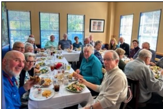
Bocce end of season lunch at La Veranda Cafe