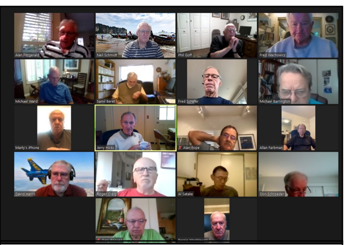
SIR Branch 116 BEC (Branch Executive Board) meeting via Zoom on September 17th

Because our activity happens outdoors, we have been able to pursue our passion, observing all the COVID limitations. Salmon fishing on the ocean is dwindling to completion. Many of us caught salmon in the last month, but fewer than before. Rock fishing on the ocean has filled the gap, and the fishing group has enjoyed two adventures recently with great success. A dozen of us have filled sacks with rock fish and ling cod weighing nearly 50 lbs. Our local lakes are still too warm for trout planting, and crab fishing on the ocean is not scheduled to start till the first Saturday in November. But, Tom Kostik, Harry Sherinian, Terry Miller, Stan Wong, and Mike Corker have been getting some stripers and black bass in the delta.