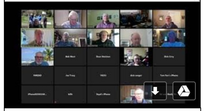
SIR Area 16 Computer & Technology Meeting via Zoom on April 16th