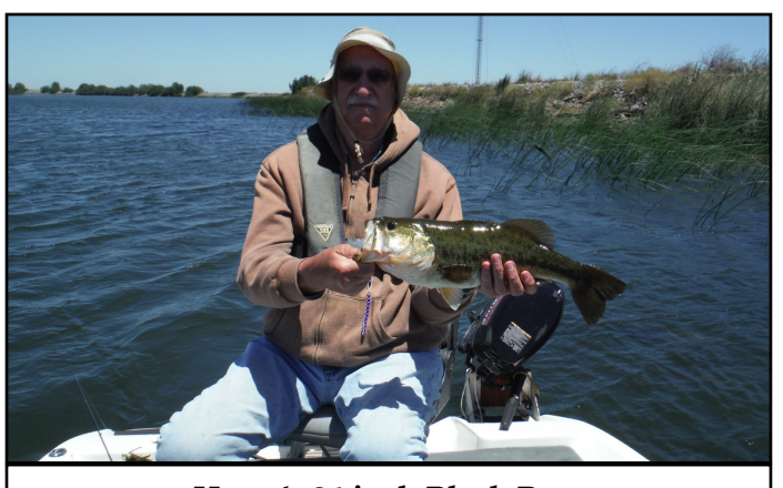
Harry's 24 inch Black Bass