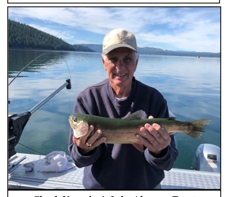
Chuck Vanocine's Lake Almanor Trout