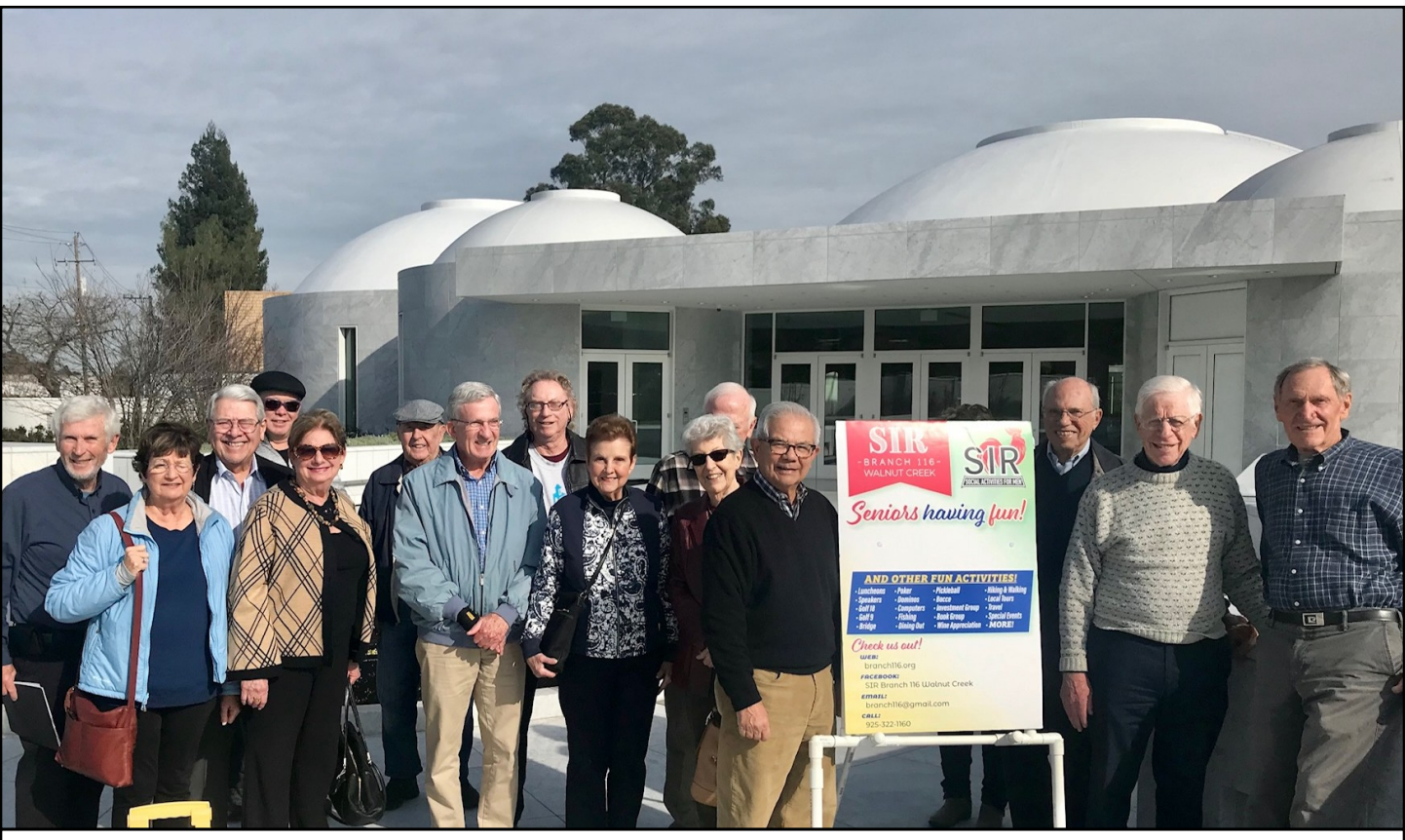
Walking Tour Group at Sufism Reoriented Sanctuary on January 25th