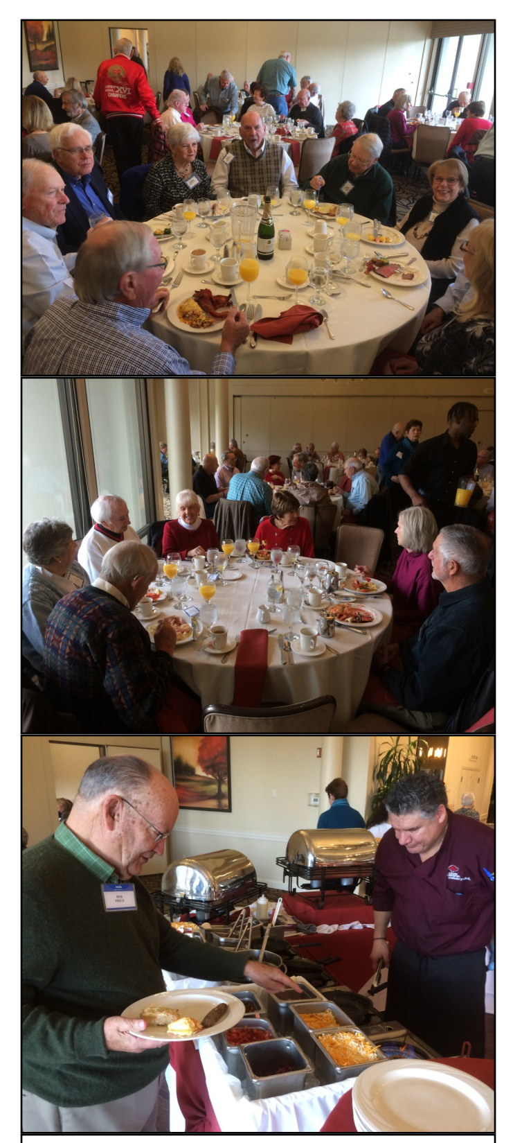
Branch 116 SIR and their wives enjoying the Annual Sunday Champagne Buffet Brunch at Crow Canyon Country Club on January 19th.