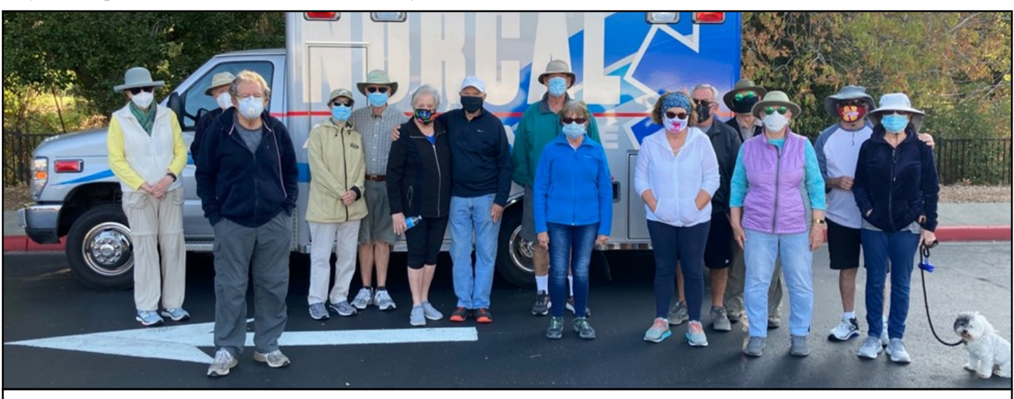
Amiable Ambers are taking extra precautions