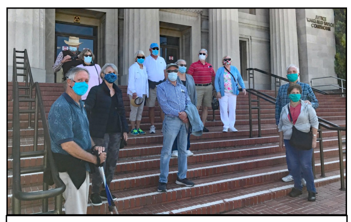
Walking Tour Group standing in front of the Martinez Court House on July 18th

The next scheduled event is a docent lead walking tour of downtown Walnut Creek on September 26.