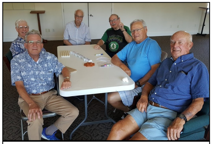
Mexican Train gang taking a break between games

The Legends opens at 7 AM. Come early and have a leisurely breakfast with your colleagues prior to the meeting. Ladies are welcome