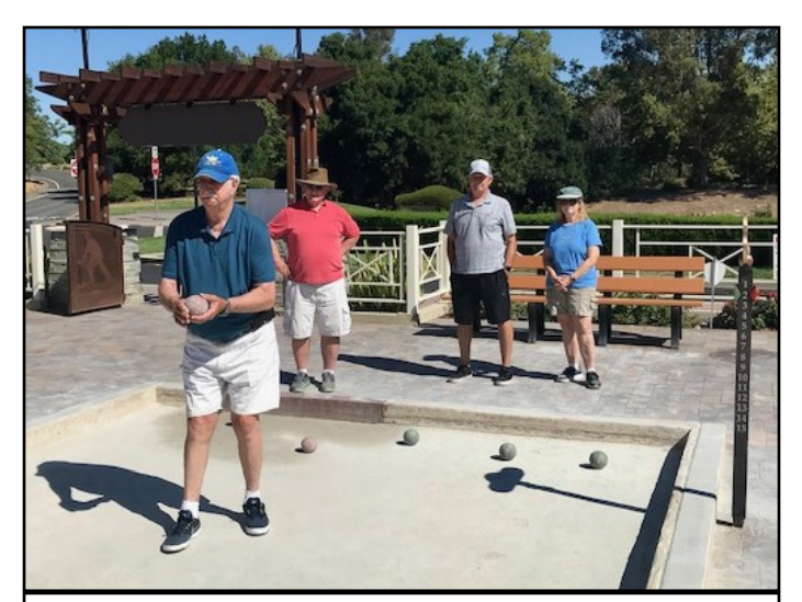
Members trying out the new Bocce activity at Heather Farms