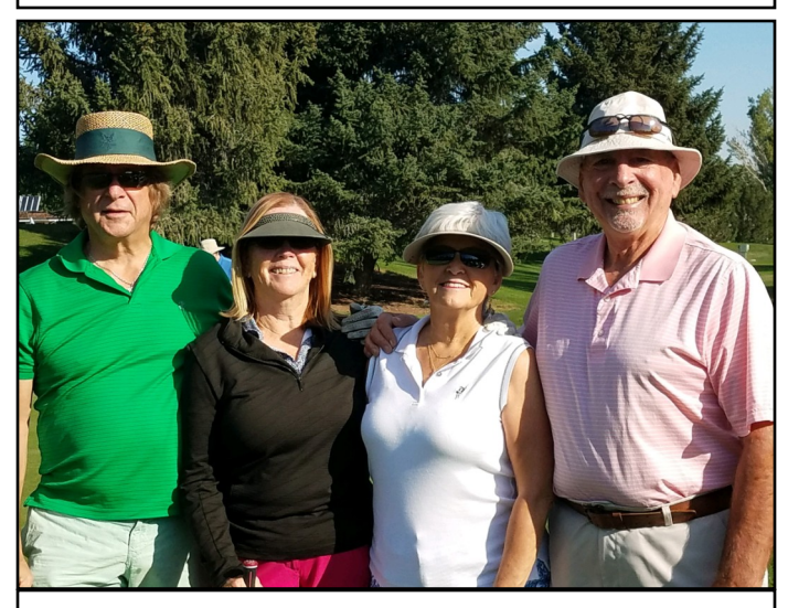
Golfers Enjoying Reno 2018