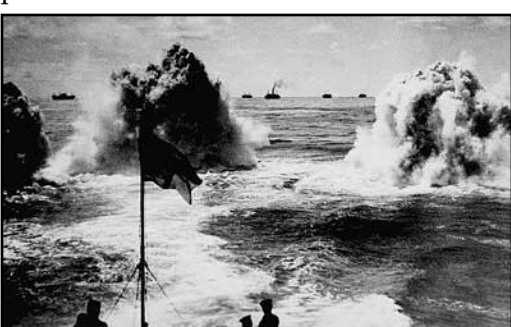
Battle of the Atlantic Photo

If Germany had prevented merchant ships from carrying food, raw materials, troops and their equipment from North America to Britain, the outcome of World War Two could have been radically different. Britain might have been starved into submission, and her armies would not have been equipped with American-built tanks and vehicles.