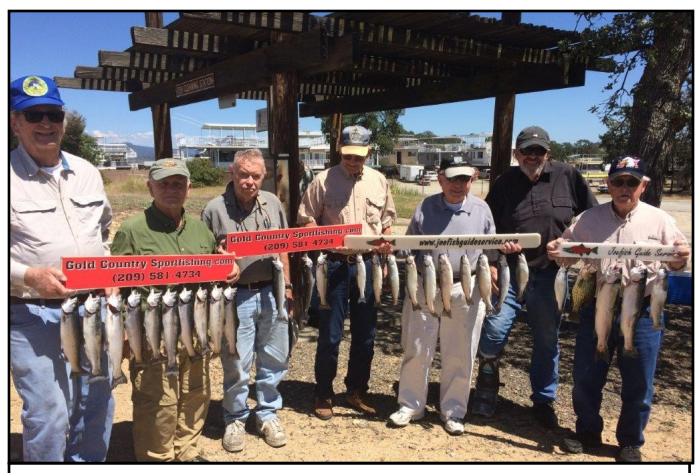
Seven happy SIRs caught these fine fish on a guided trip to Lake Don Pedro