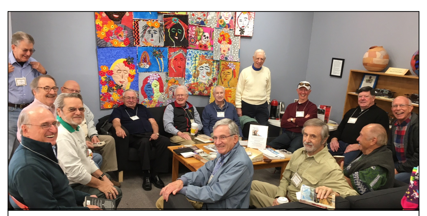
The Book Group in January 22, 2018 at Orinda Books

I will be sending our notices. Let me know if you would like to be added to our list.