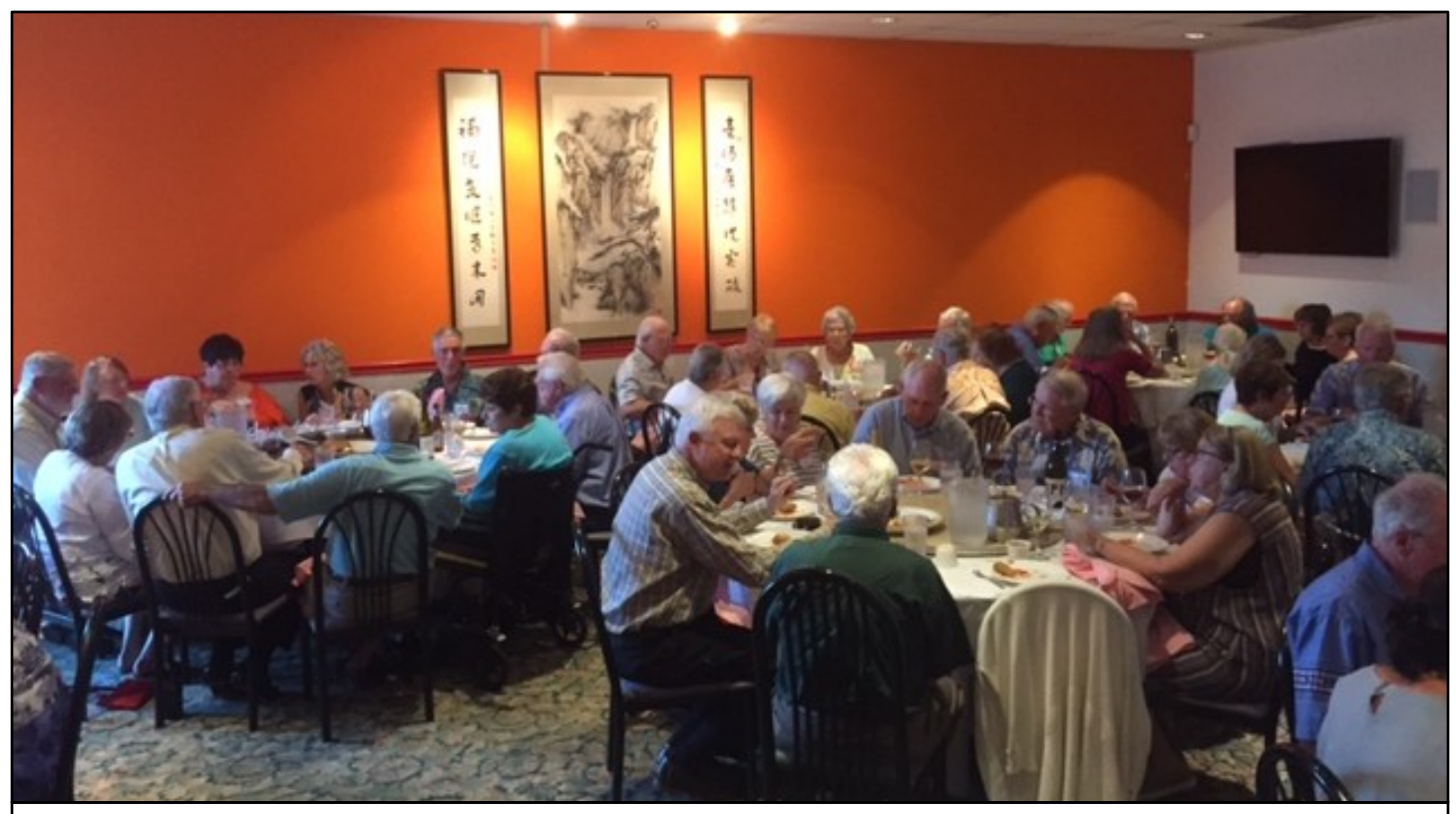
Dine-O-SIR enjoying themselves at "The Three Bros. from China Restaurant" in Pleasant Hill on August 23