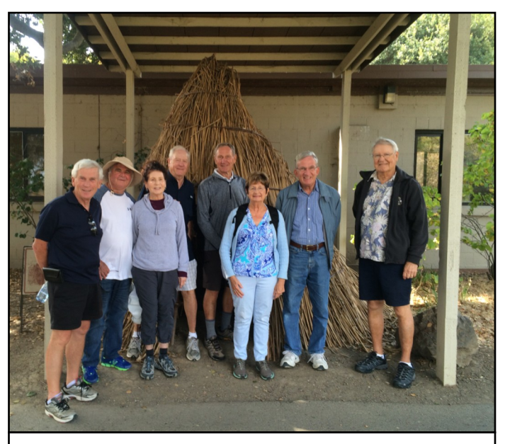
Walking Tour Group at the East Bay Regional Parks Coyote Hills Visitor Center on August 19th.