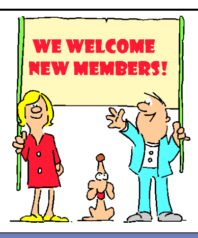
Want a Free Lunch? Sponsor a New Member!