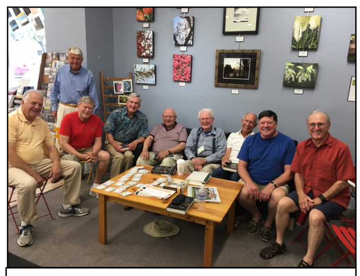
Book Group at Their May Meeting