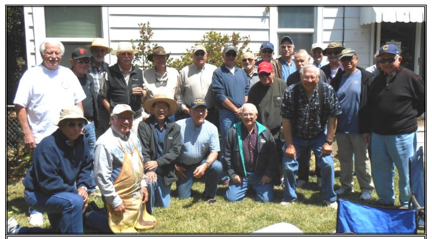
Fishing Club looking "satisfied" at their annual Fish Fry

We will be very busy this summer with: delta fishing for bass, catfish, striped bass, crappie, bluegill, and sturgeon; trout and catfish in mountain and local lakes, salmon and rockfish on the ocean. We live in a fishermen's paradise.