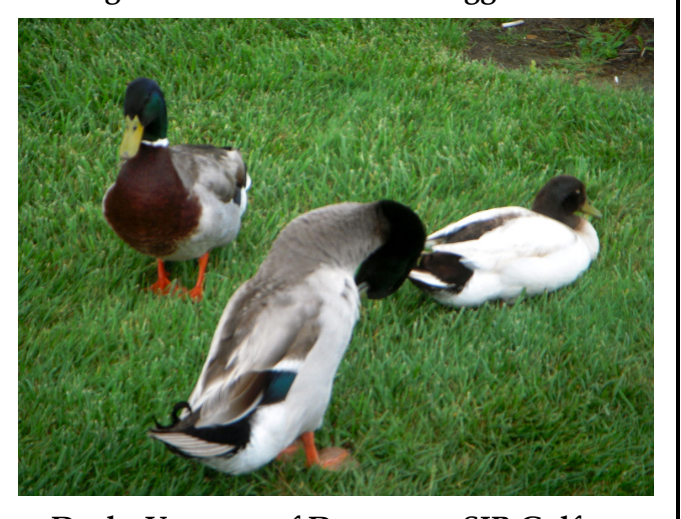
Ducks Unaware of Dangerous SIR Golfers