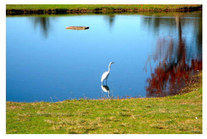
Egret Wading in the Pond on #3

In 2012, Boundary Oak Golf Course achieved designation as a "Certified Audubon Cooperative Sanctuary" through the Audubon Cooperative Sanctuary Program for Golf Courses, Boundary Oak Golf Course is the 38th course in California, and the 969th in the world to receive the honor.