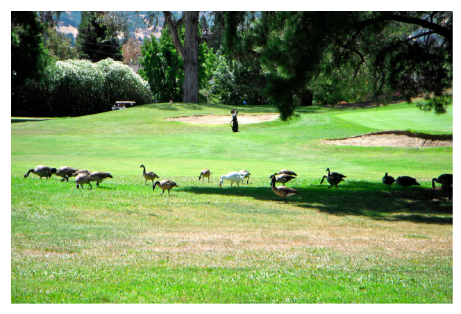
Single White Goose with a Gaggle on #10