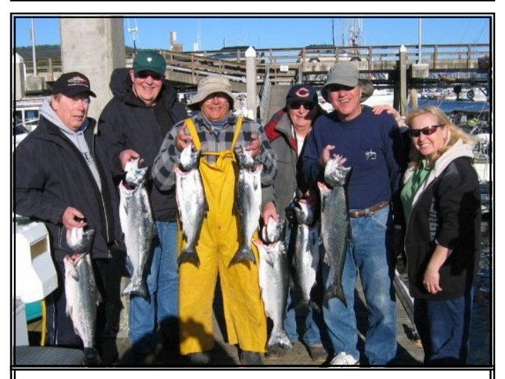
First Salmon Trip in 2012