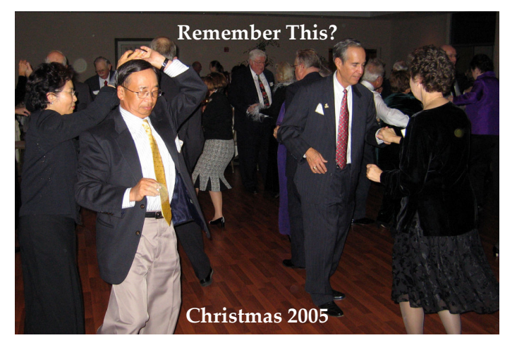
Gala Christmas Dinner Dance at Boundary Oak