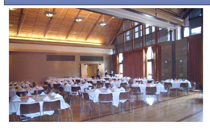
Lafayette Veteran's Hall Is Set-up for a Party