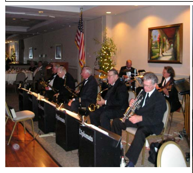
"The Diplomats" Provided the Music for Dining, and Dancing