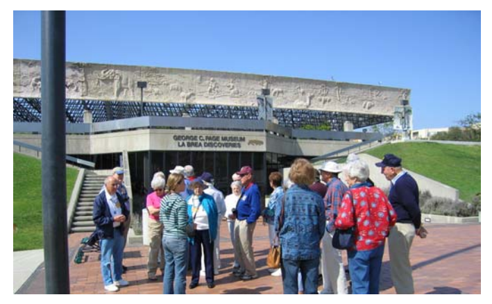
Next we visited the La Brea Tar Pits