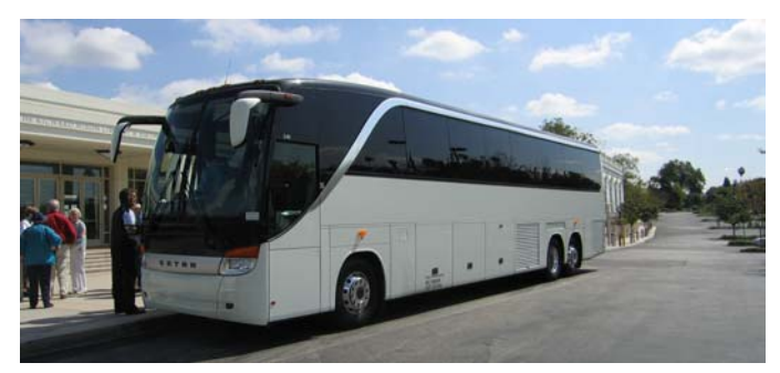
Our Motorcoach took us to at the Nixon Library