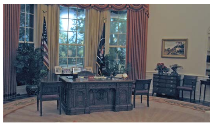
A replica of the Oval Office is at the Library