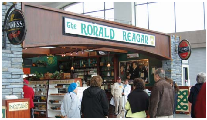
An Irish Pub named after Reagan was imported