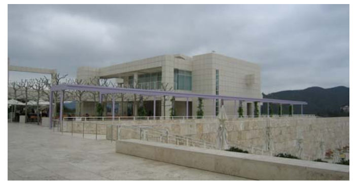
The next morning we visited the Getty Museum