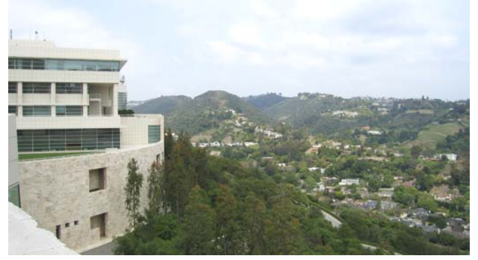
There were stunning views of LA from the Museum