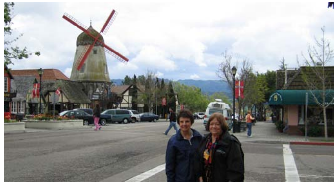
We had lunch and shopped in Solvang