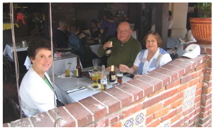
We had lunch at Olivera Street in LA