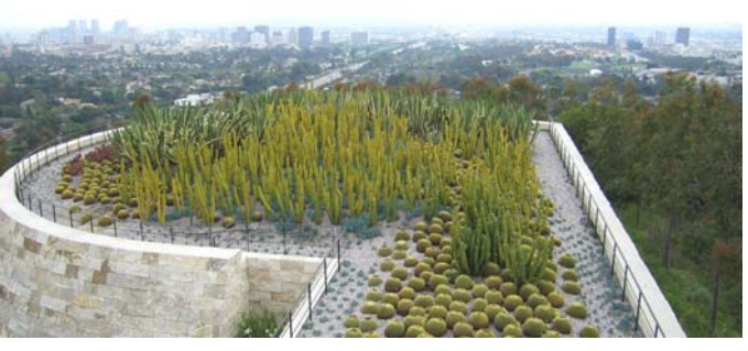
The Getty Museum is surrounded by unusual gardens