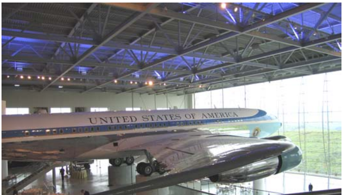
The original Boeing 707 that served as Air Force One is housed at the Reagan Library.