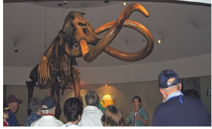
Our Tour Guide showed us some of the creatures recovered from the Tar Pits