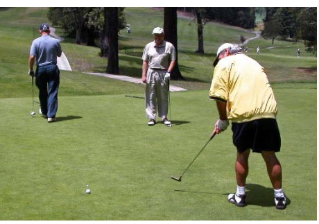
Leaning towards the hole sometimes helps.