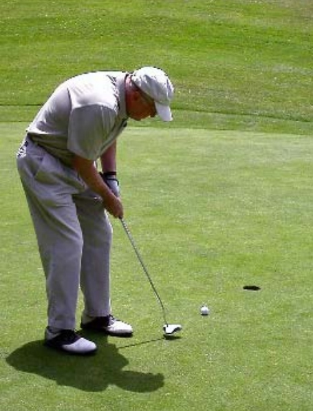
Guess who is going to miss this putt? Good thing the resulting words weren't recorded.