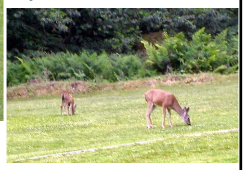
Grazing in the fairway is the safest place to avoid Branch 116 golfers.