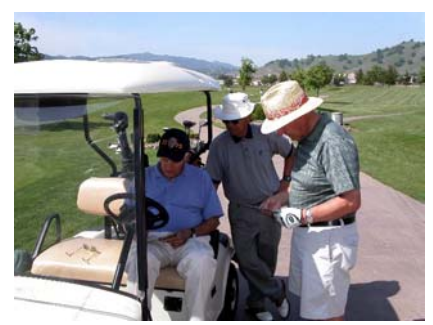
Do you think the Golf Chairman will suspect something when we turn in our scorecard?