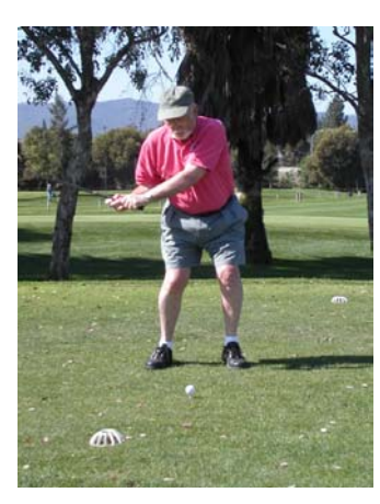
I'm wearing my lucky shirt.