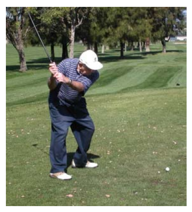
I'm keeping my head down no matter what happens.