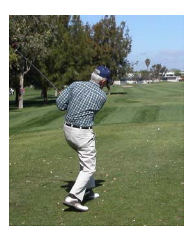
That has got to be the shortest drive of my life.