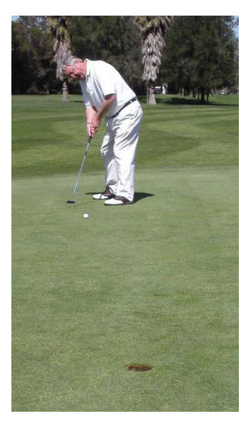
I agree. The holes on the practice green were much larger.