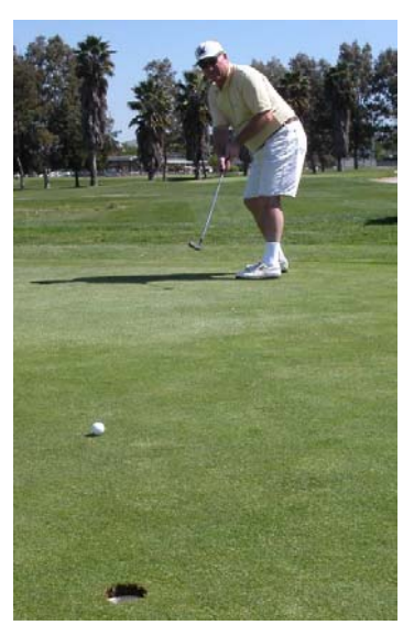
I think the hole is smaller than usual.