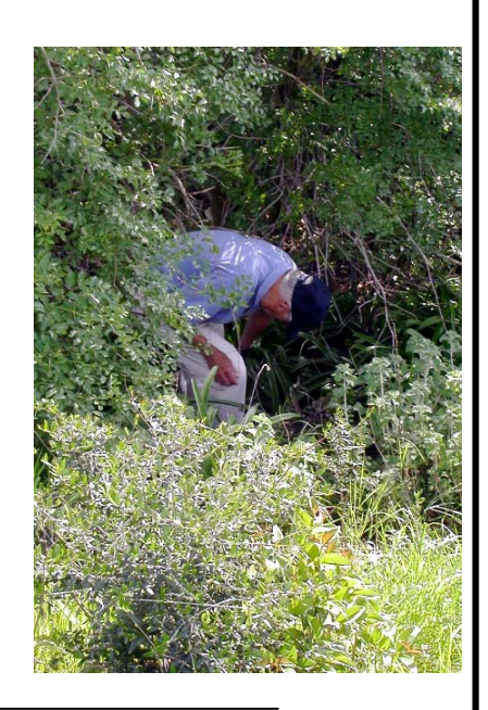
The Precision Hitters