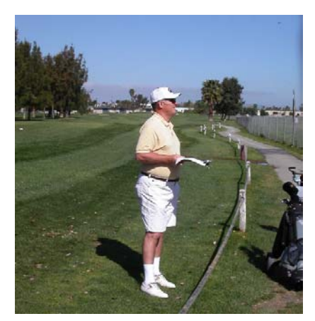
OK Guys, listen up!