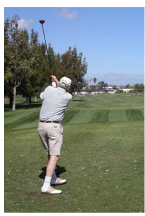
I can't believe it stopped so soon!