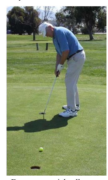
Even my special yellow balls won't drop.