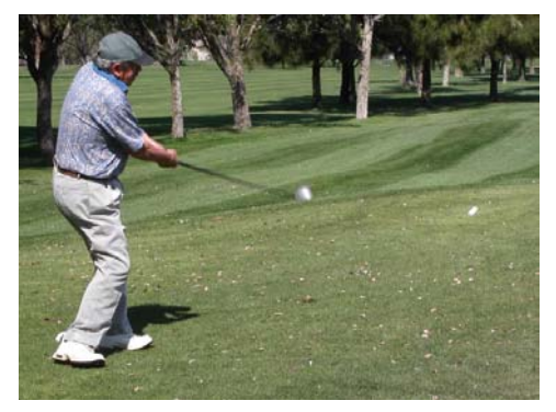
It's a low screamer but it should make it past the ladies tee!