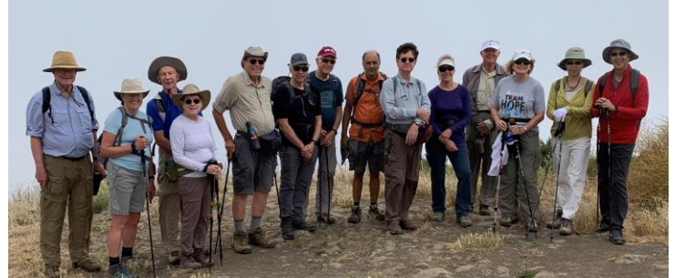
SIR hiking group posing for us at Windy Hill

The August SIR Hike was on the Razorback Ridge Trail to Lost Trail with an add on to the top of Windy Hill. Fifteen SIR members and guests hiked approximately 6.5 miles and climb roughly 1000 feet. We started off in deep fog which was a change from the heat we have had lately. We hiked to the top of Windy Hill with the hope that we would have a view of the Bay Area but the view was blocked by the fog. Eventually the sun came out on the return trip and we had a good view of the South Bay and Stanford. The after hike debriefing took place at Alices's Restaurant.