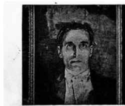
JOE HILL'S LAST WILL (Written in his cell, November 15, 1915, on the eve of his execution)

My will is easy to decide, For there is nothing to divide, My kin don't need to fuss and moan— "Moss does not cling to rolling stone." My body? Ah, if I could choose, I would to ash it reduce, And let the merry breezes blow My dust to where some flowers grow. Perhaps some fading flower then Would come to life and bloom again. This is my last and final will, Good luck to all of you, —JOE HILL