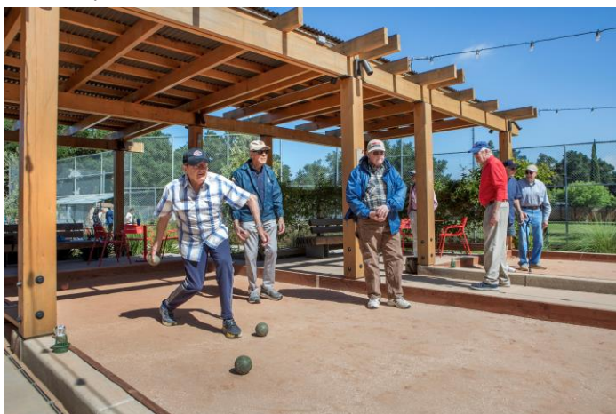
Sir Branch 35 Bocce players show how it's done!

Location: Bocce Ball Courts at the Los Altos Community Center, 97 Hillview Ave., Los Altos (off San Antonio Road), 650-947-2790. Ample parking in front. The Bocce Ball courts are in the left rear of the site as you face the front entrance of the Center.