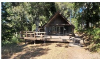
and hiker's hut

On August 26 th twenty-nine SIR hikers took a cool hike in the redwoods in the Sam McDonald Park near La Honda. Eight woman guests joined the hike as our SIR hiking activity continues to attract more women hikers.