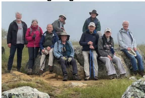
SIR Hikers at Turtle Rock

Long Ridge Preserve is on the western slope of Skyline, and we were greeted by grey sky and ocean mist. The recent rain transformed Peters Creek into rapidly rushing water. The ferns were abundant, and the Peters Creek Trail was in good condition as we hiked in woodlands. We rapidly climbed up to Long Ridge Road. We turned left on Ward Road and took the Hickory Oaks Trail up to Turtle Rock. We were now in the grasslands with verdant green rolling hills, and as we expected some muddy conditions.