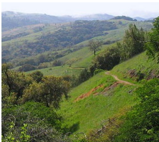
View of Bella Vista Trail

On January 28th many SIR Branch 35 hikers, significant others, and guests will take advantage of the warmer weather with expected clear sky to hike to the top of Black Mountain in Monte Bello Preserve — a 5.4 mile, 1,150' elevation gain hike. The picture is a view of the Bella Vista Trail and Monte Bello Preserve, with Russian Ridge Preserve in the distance.