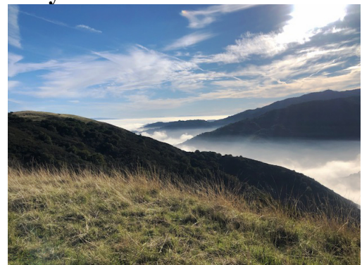
View above the clouds at Mt. Umunhum trailhead