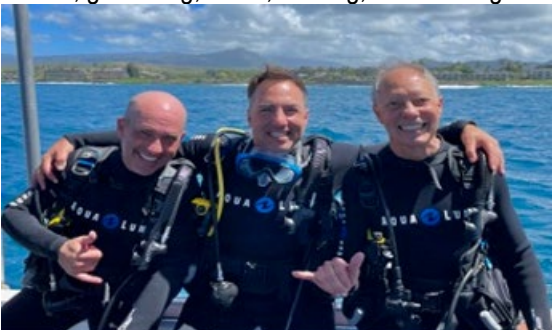
SCUBA diving with my two sons in Kauai

In my retired life I relished the opportunity to volunteer at Hidden Villa in Los Altos as a guide for elementary school children exploring the wilderness, farm animals and educational garden. This community service perfectly matches my appreciation of children and nature at the same time. I'm also very involved in photography and am a six-year member of the Palo Alto Camera Club. My other interests include backpacking in the high Sierra, SCUBA diving in Hawaii, gardening, travel, running, and working out.