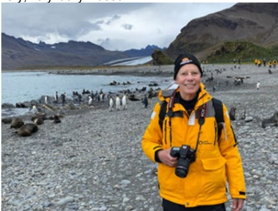
Standing on the Seventh Continent, Antarctica

At the age of fifty-eight I brought on an associate, soon-to-be-a partner. We practiced together in harmony for the next ten years when I knew it was time to transition to retired life. I'm still in communication with several of my exceptional team via Facebook and gathered this month with six of them to laugh over tales of the antics we played on each other. I had great passion for my practice of pediatric dentistry and wouldn't have traded it for anything. I feel very, very lucky indeed.