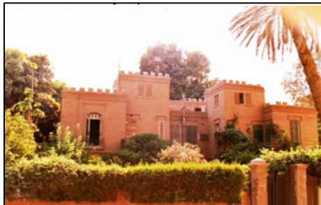
Childhood home in Cairo

I grew up in Cairo until age 11 when world events forced me to leave. Following the Suez Canal crisis of 1956, when France, the UK and Israel attacked Egypt to seize the canal, the situation for non-Egyptians and especially Jews became untenable. My sister and I were sent to safety at a boarding school in Versailles, near Paris. We were a little scared to travel by ourselves, but our native tongue is French with a slight Levantine accent, and we were quite familiar with France since we took our family summer vacation there. We were fortunate to have good family friends who lived in Paris, so every weekend we took the train from Versailles, where our boarding school was, and