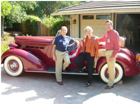
Running for City Council