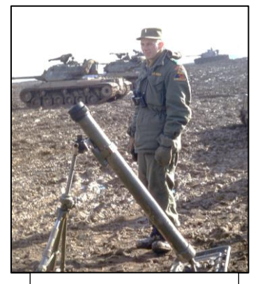
Maneuvers – Germany, 2<sup>nd</sup> Armored Division

Unemployment was at 13% when I graduated and with a military draft looming, I was accepted to the Navy Supply Officers School but was drafted into the Army before they could give me a deferment. I trained with the 10<sup>th</sup> Infantry in the cold at Fort Riley, Kansas and then went to Artillery Officer Candidate School (OCS) in the heat at Fort Sill, Oklahoma. With daily physical training over a full year, I was in the best physical condition of my life.