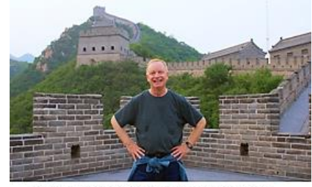
On the Great Wall - Badaling, China

on daily walks in the neighborhood. My wife and I still enjoy trips to the Sierras and occasional trips to other parts of the US as well as to other countries. We have enjoyed some great trips to such places as Beijing, China, Peru, Canada, and many parts of Europe. We