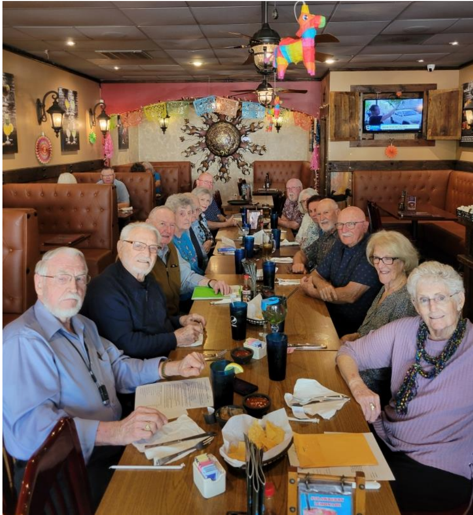
Second Tuesday Dining Club