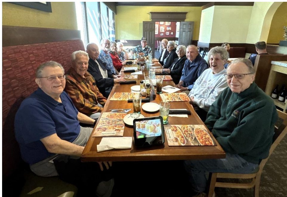
Fourth Thursday Dining Club