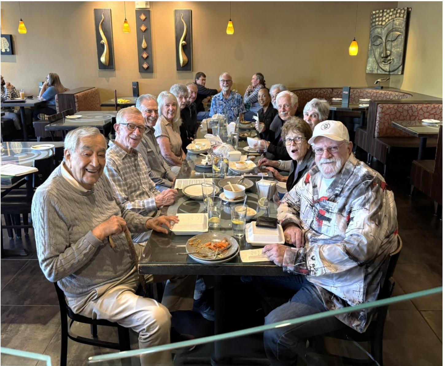
4th Tuesday Dining Club

***** If you enjoy Dining Out at different restaurants in our local area and are interested in joining one of our 3 social, fun loving, evening Dining Out Clubs, please contact Chairman Vince Sereno at (209) 524-9630. *****