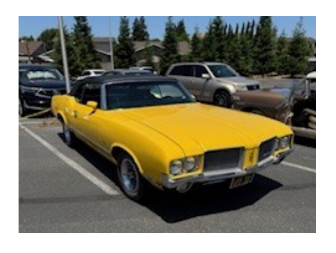
Don Fitzgerald 1971 Oldsmobile Cutlass