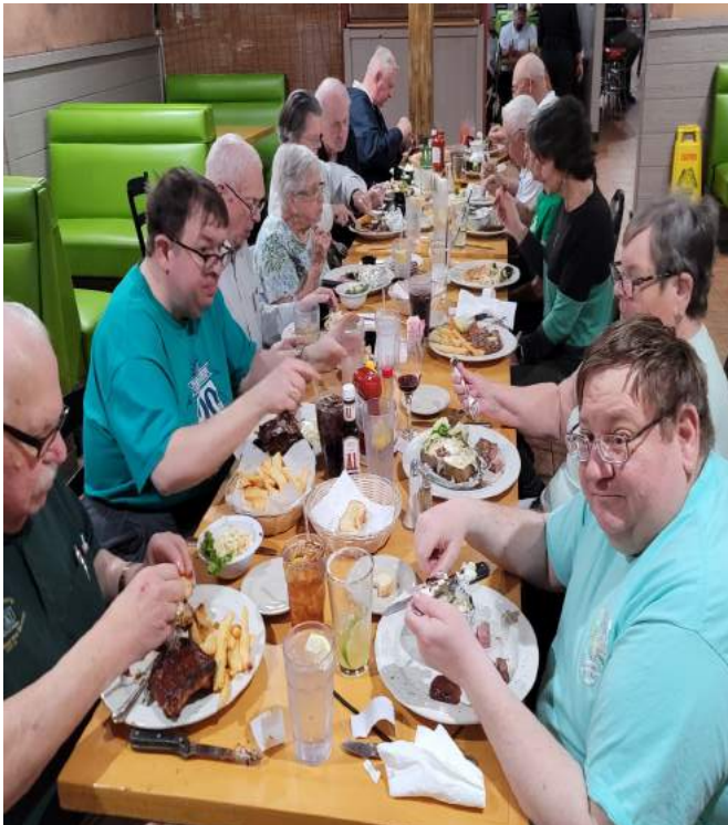
Couples Dine Out at George's Steakhouse in March

The robots move at pedestrian speed and use a combination of sophisticated machine learning, artificial intelligence and sensors to travel on sidewalks and navigate around obstacles. The computer vision-based navigation helps the robots to map their environment to the nearest inch. The robots can cross streets, climb curbs, travel at night and operate in