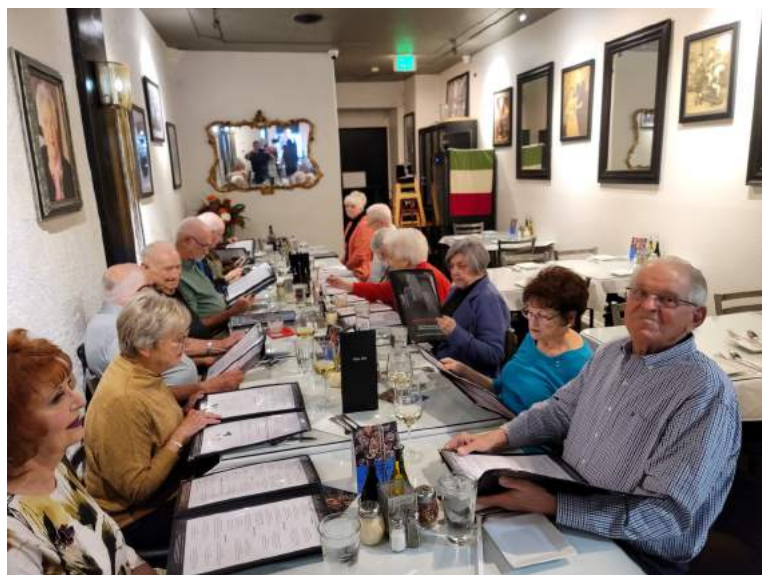
Branch 103 Dine Out at Chefs of New York in February