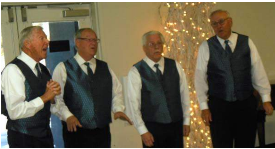
The Common Ground Quartet, once again entertained the Branch 103 Ladies' Day Luncheon on Wednesday, December 13. They sang some Christmas songs and some oldies, such as "Lidia the Tattooed Lady".