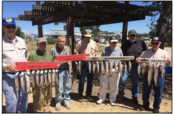
Seven happy SIRs caught these fine fish on a guided trip to Lake Don Pedro