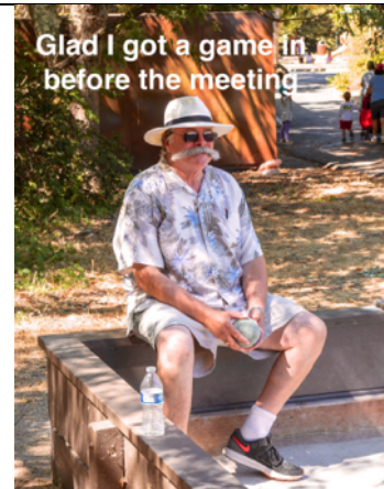
Glad I got a game in before the meeting