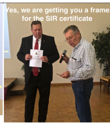
Yes, we are getting you a frame for the SIR certificate