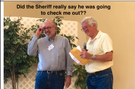
Did the Sheriff really say he was going to check me out??