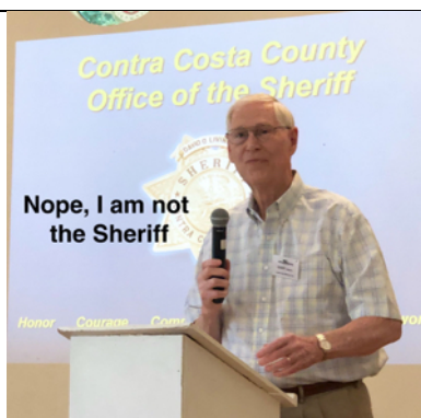
Nope, I am not the Sheriff