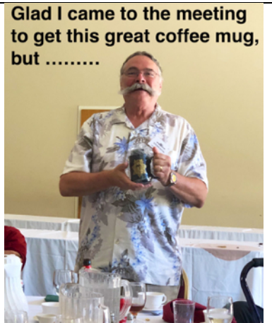
Glad I came to the meeting to get this great coffee mug, but .....