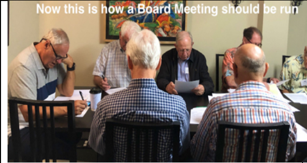
Now this is how a Board Meeting should be run