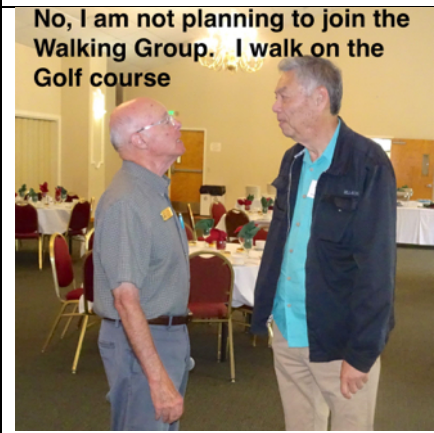
No, I am not planning to join the Walking Group. I walk on the Golf course