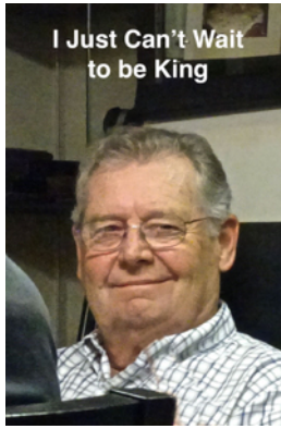
I Just Can't Wait to be King