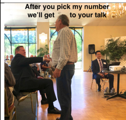
After you pick my number we'll get to your talk