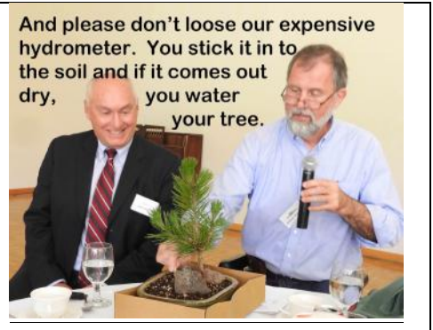
And please don't loose our expensive hydrometer. You stick it in to the soil and if it comes out dry, you water your tree.