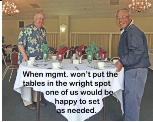
When mgmt. won't put the tables in the wright spot one of us would be happy to set as needed.