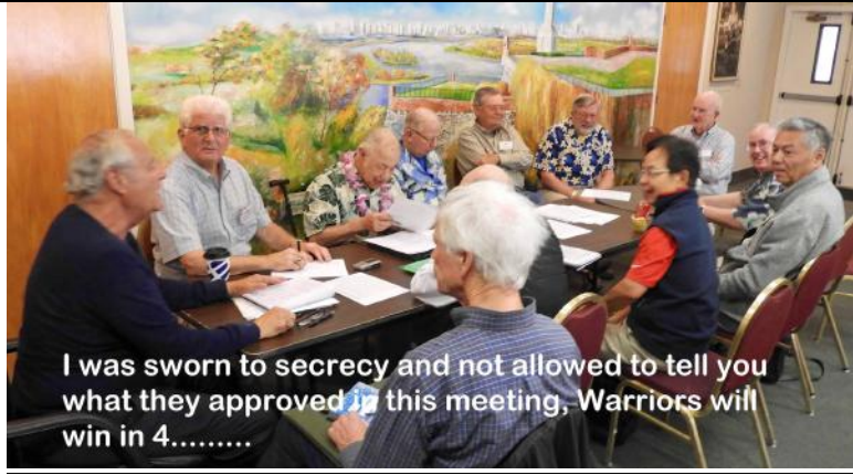
I was sworn to secrecy and not allowed to tell you what they approved at this meeting, Warriors will win in 4.....