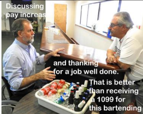
Discussing pay increas