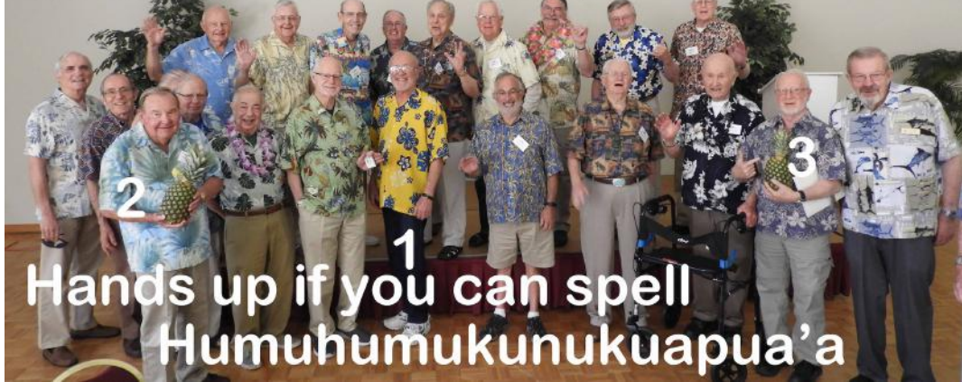
Hands up if you can spell Humuhumukunukuapua'a