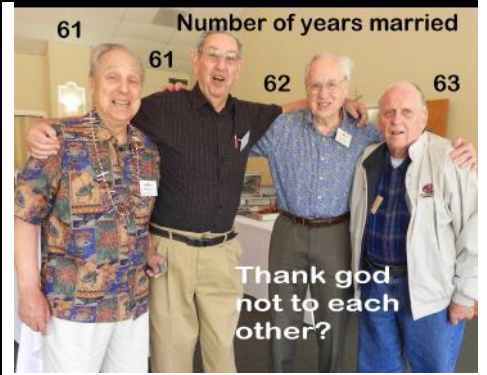
61 Number of years married 61 62 63