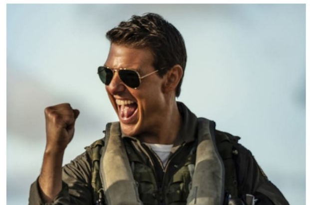
'Top Gun: Maverick' jets to new box office record

Area SIR Members Top Gun-Wednesday June 15th | nearest 1 pm Maya Cinema Campus Pointe Lunch-11 am-Bulldoc