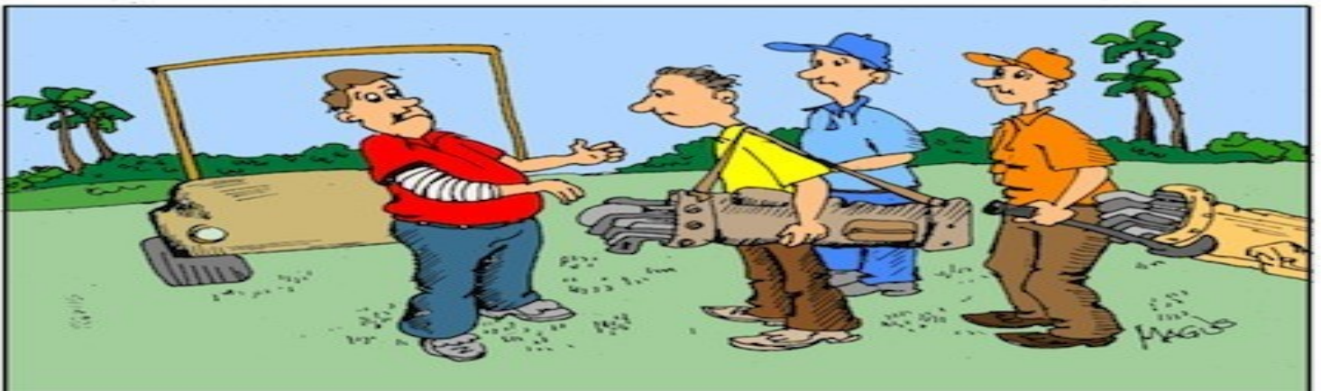
The medical term is 'Golfer's Elbow'. It's caused by too much time spent hoisting pints of beer after a round.