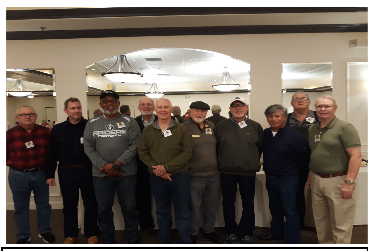
2022 SIR 159 OFFICERS AND DIRECTORS