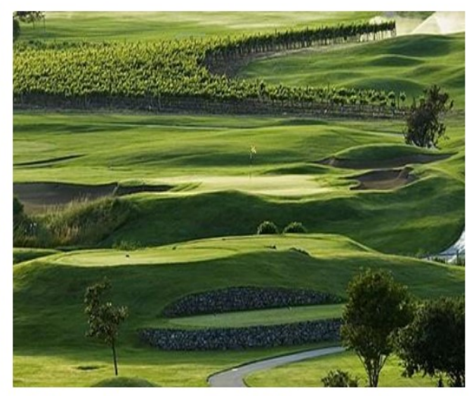
* Eagle Vines Golf Course, Napa *