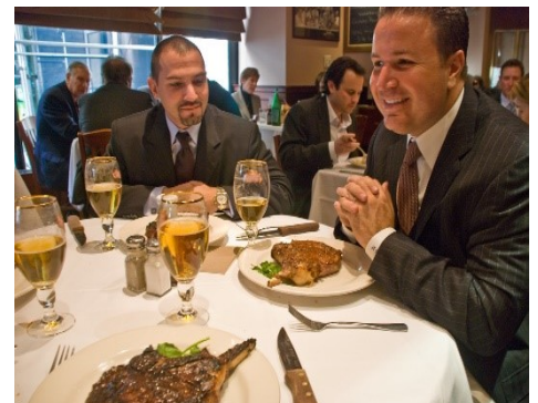
This Photo by Unknown Author is li-