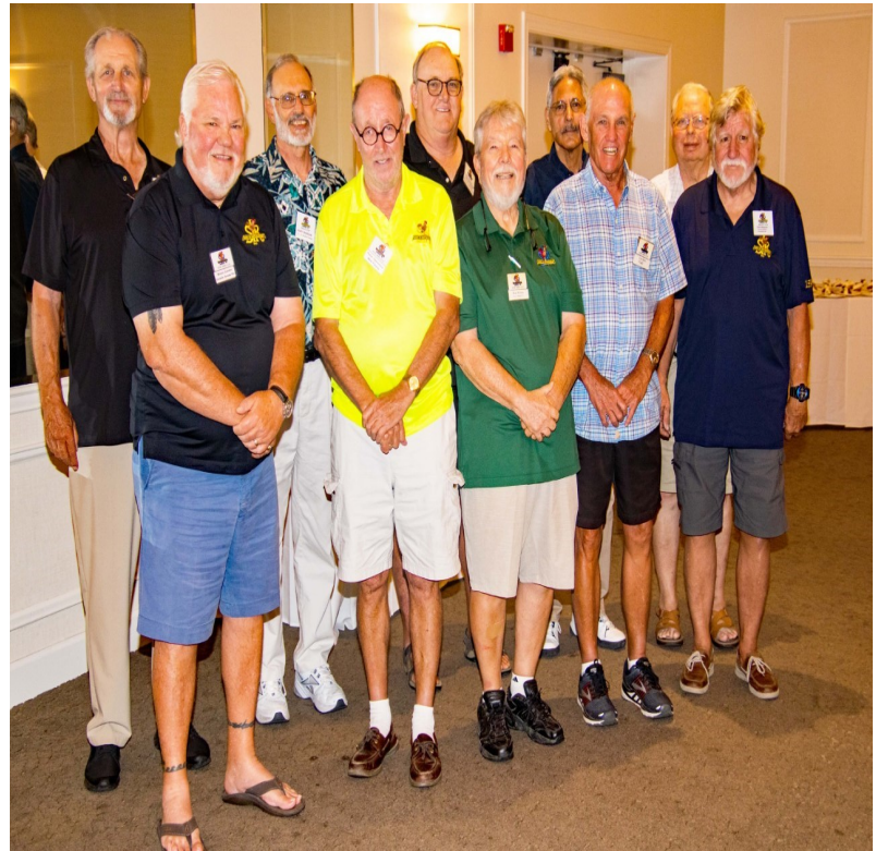
Picture of 2020 SIR 159 officers.