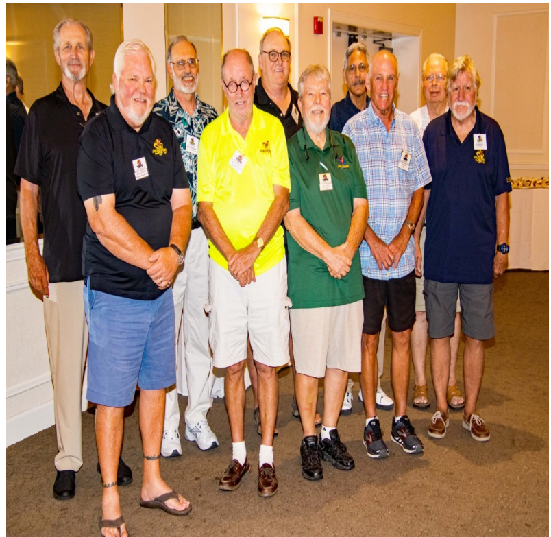
Picture of 2020 SIR 159 officers.